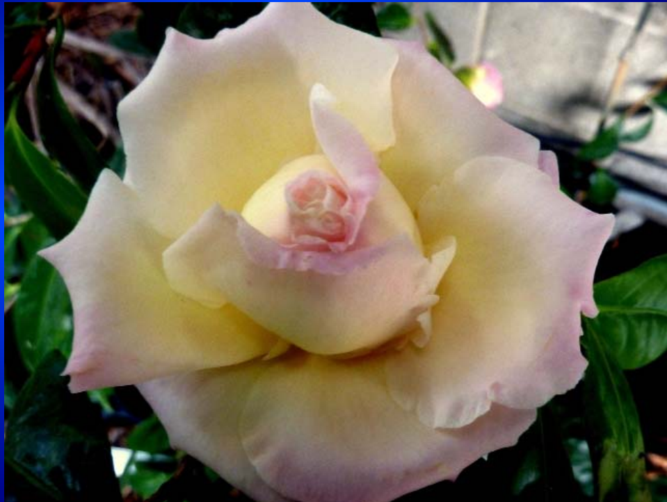
C. Hybrid 'Senritsu-ko'

ROSE FORM DOUBLE – Layers of petals appearing as a rose bud in early stage maturing to an open bud showing stamens in a concave center.