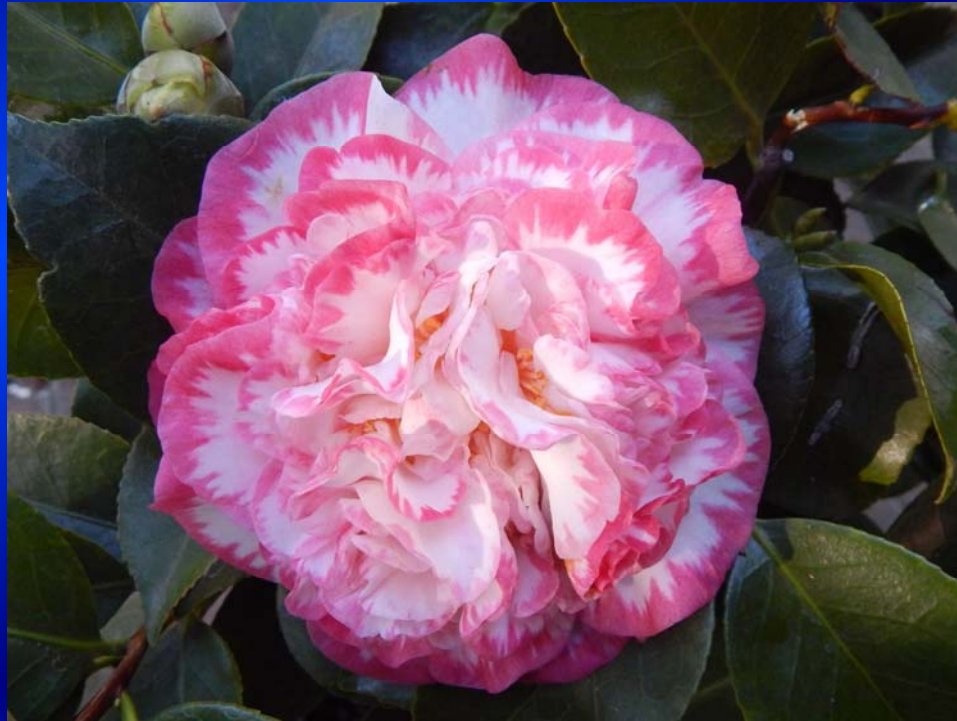
C. Japonica 'Margaret Davis'

Full Peony Form – Convex mass of mixed irregular petals, petaloids and stamens never showing stamens.