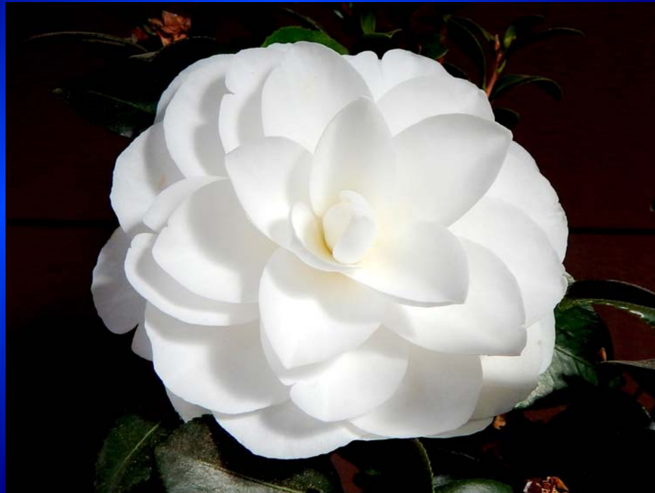
C. Japonica 'Nuccio's Gem'

FORMAL DOUBLE – Fully imbricated, many rows of petals, never showing stamens.