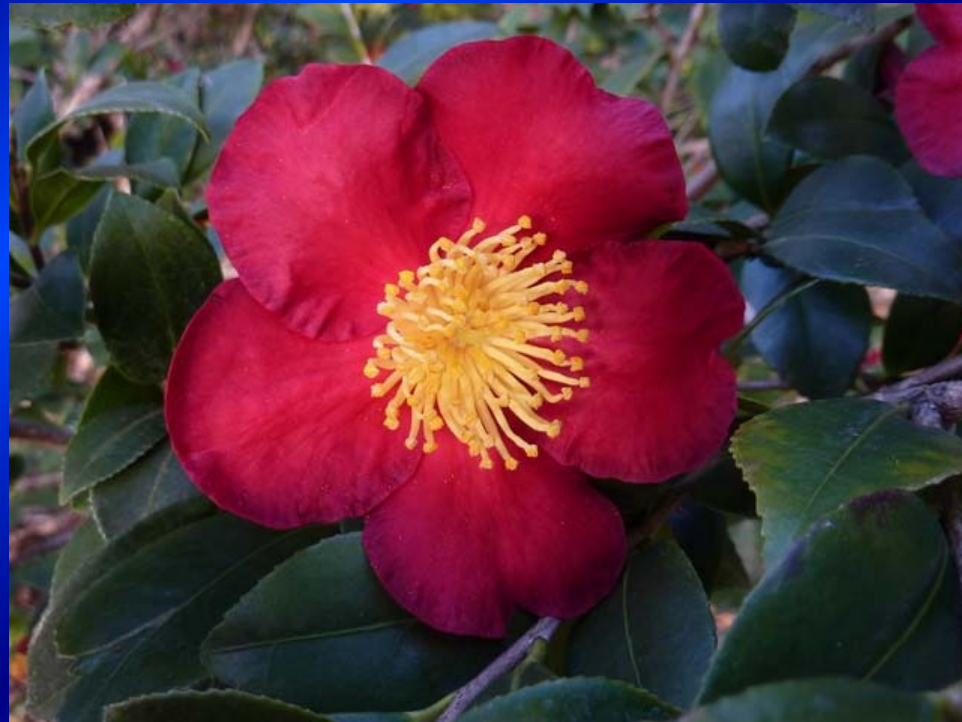
C. Sasanqua 'Yuletide'

SINGLE – One row of not over eight regular, irregular Or loose petals and conspicuous stamens.