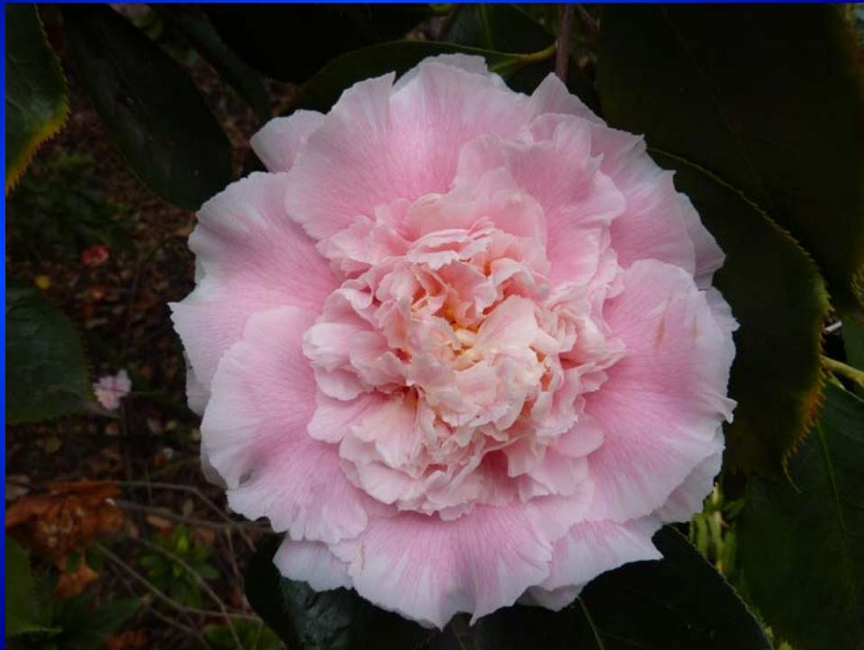
C. Japonica 'Elegans Splendor'

ANEMONE FORM – One or more rows of large outer lying flat or undulating; the center of a convex mass of intermingled petaloids and stamens.