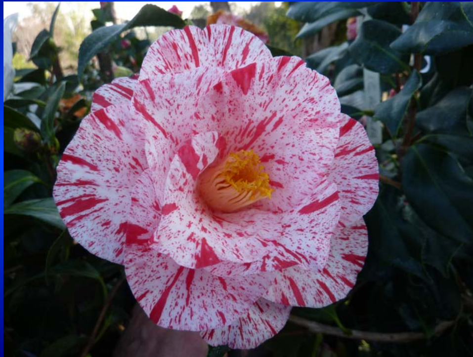
C. Japonica 'Betty Foy Sanders'

The petals may overlap or be in rows Sometimes blooms can have a concave center